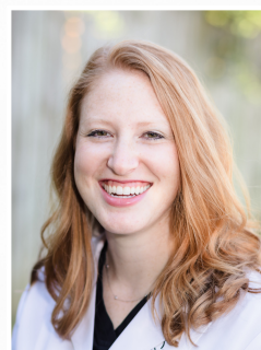
Brooklin Byrd New Dentist Committee